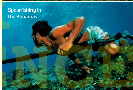
Spearfishing in the Bahamas