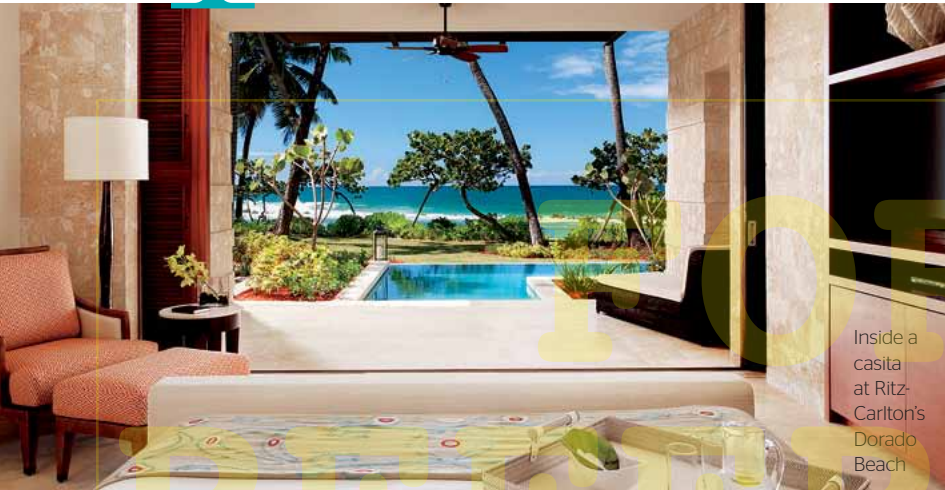
Inside a casita at Ritz-Carlton's Dorado Beach

How can you possibly resist? We tempt you with this season's most promising openings.