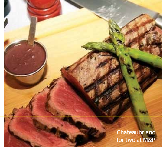
Chateaubriand for two at M&P

First came the Pete Dye golf course, opened in 2011. Next up: 36 rooms and 11 villas coming soon to this oceanfront north-shore resort. Villas feature private plunge pools , but all guests have access to two infinity pools, a 1,000-foot beach , two restaurants, and the Mesoamerican Reef just offshore. From $295. 855-224-6620; las-verandas.com