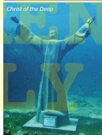
Christ of the Deep

Scuba and snorkel tour operators, including Aquaworld