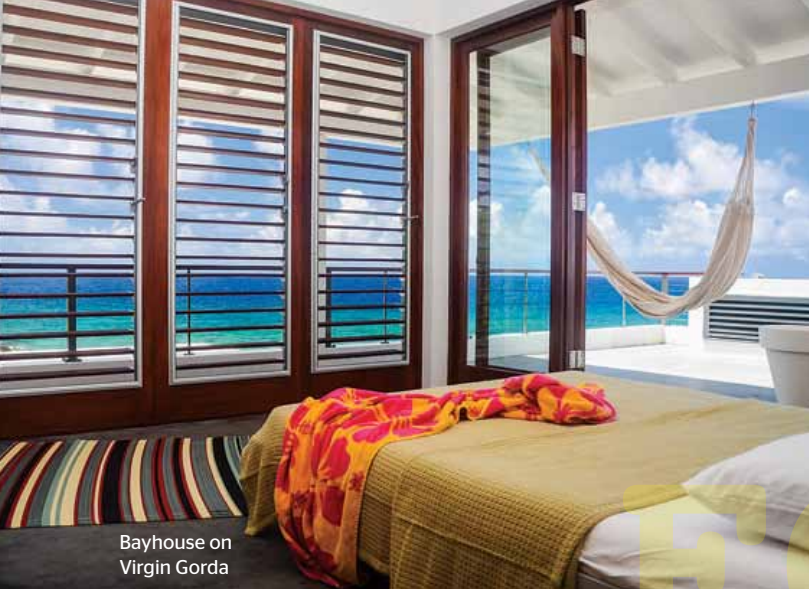
Bayhouse on Virgin Gorda