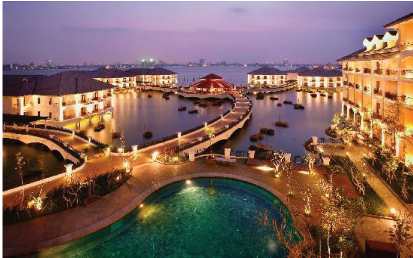
Intercontinental, Westlake - Hanoi