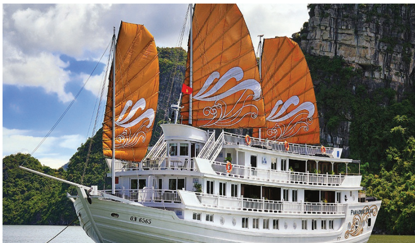
Paradise Cruise - Halong Bay

Discover absolute tranquility at this luxurious urban resort uniquely placed over the serene waters of West Lake while only minutes from Hanoi's famous Old Quarter. Relax in contemporary Vietnamese designed Classic rooms with spectacular views from your own private balcony. The hotel also has a fully-equipped fitness centre located in its own building.